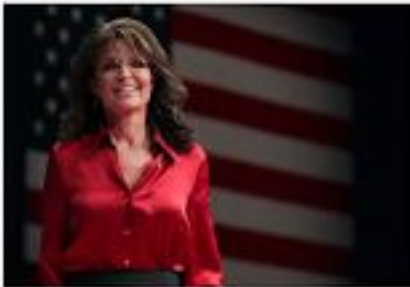
“Gov. Sarah Palin Writes To The Elijah List Family!” Sarah Palin, Wasilla, Alaska